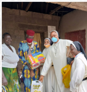
Sisters deliver supplies to a family in Nigeria.