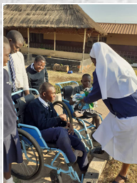
Special-needs children in Zambia receive protective masks.

Our Sisters report several populations with special needs: the disabled, the mentally challenged, the elderly, children who have lost parents, displaced persons living in refugee camps, and workers who pre-COVID relied on basic farming and menial jobs to put food on the table. In addition to supplying them with food and supplies, teams of Sisters also began training sessions on COVID prevention and best practices for washing and cleaning.