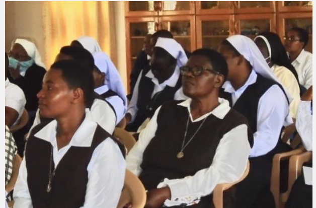
Sisters in Uganda gather to learn more about the counseling center and available services.

The AAC:SS board is keeping pace with the dynamic activity of the sisters in Africa. With significant input from the sisters, the board developed a new strategic plan, built on revised mission and vision statements and clear strategic initiatives. AAC:SS is well positioned for continued growth.